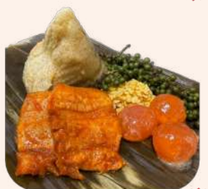
19. 藤椒蛋黄肉粽 NEW