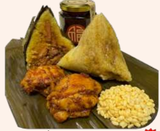
16. 南洋参巴鸡粽 NEW